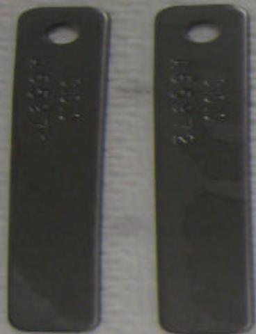
Blank pH = 7.7