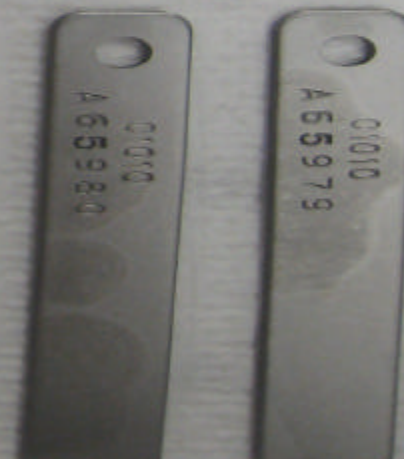
18 PPM orthophosphate, 3.0 ppm zinc pH = 7.7