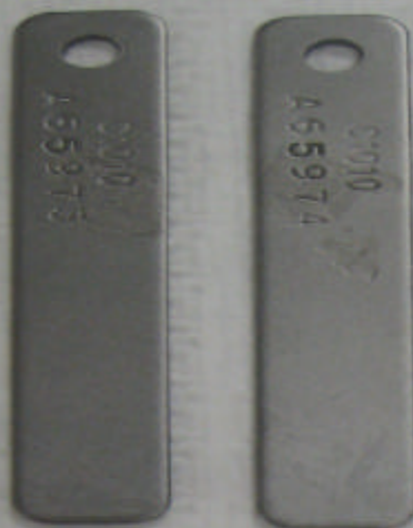
300 PPM AS 8310 pH = 7.7