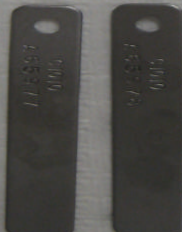
9 PPM orthophosphate, 1.5 ppm zinc pH = 7.7