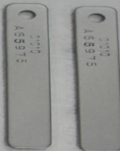
400 PPM AS 8310 pH = 7.7